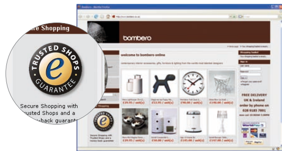
Trusted Shops Seal of Approval

"Immediately after receiving the seal of approval, there was a 30% jump in sales!"